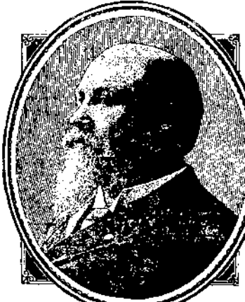
HAZEN S. PINGREE

Among all the great men of the world, few have been so widely and so justly appreciated as Hazen S. Pingree. He was a man of great ability and high character, and his life was a life of service to his fellow men. He was a man of great ability and high character, and his life was a life of service to his fellow men.